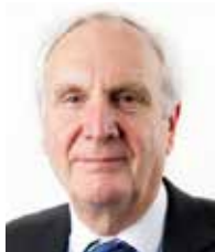
LORD EDWARD UDNY-LISTER - CHAIR CO-CHAIR AT UAE-UK BUSINESS COUNCIL

Lord Udny-Lister has been UK Co-Chair of the UAE-UK Business Council since 2020. Prior to this he was Chief Strategic Advisor to Prime Minister Boris Johnson, and the Prime Minister's Special Envoy to the Gulf Region.