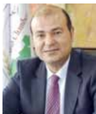
H.E. DR. KHALED HANAFY - CHAIR SECRETARY GENERAL AT UNION OF ARAB CHAMBERS

Dr Khaled Hanafy is the "Secretary General of the Union of Arab Chambers" and Professor of Economics and International Business. He held several Governmental, academic, business and consultancy positions, most recent of "Minister of Supply and Internal Trade in Egypt", "Chairman of Internal Trade Development Authority" and "Dean of College of International Transport & Logistics" in the Arab Academy for Science, Technology & Maritime Transport.